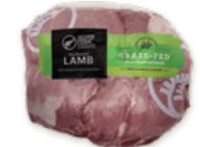
7. Leg Chump-off Knuckle Tip-off